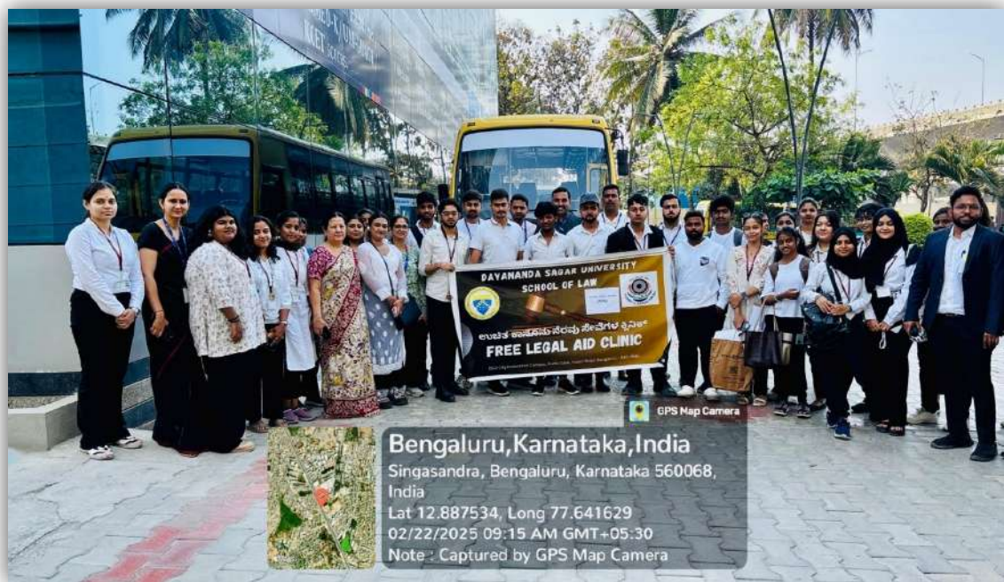
Legal Services Clinic, DSU at City Innovation Campus and Haraholi campus