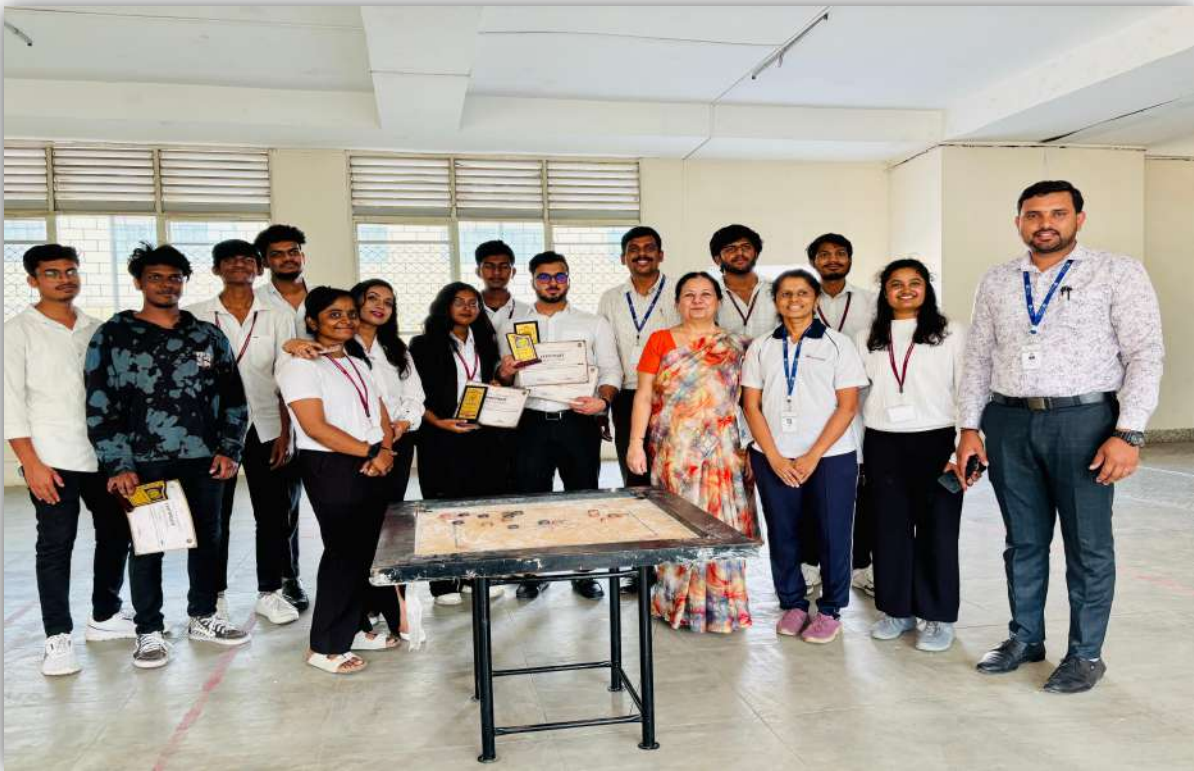
Carrom Tournament 2025 | School of Law, DSU