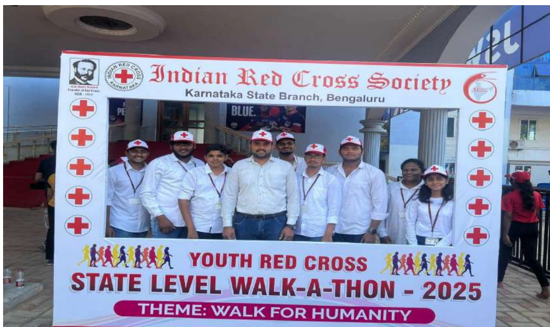
Students' participation in State Level Walk-A-Thon- 2025