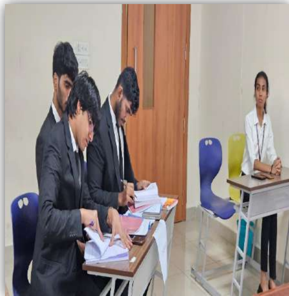
Internal Moot Court Competition 2025 | School of Law, DSU