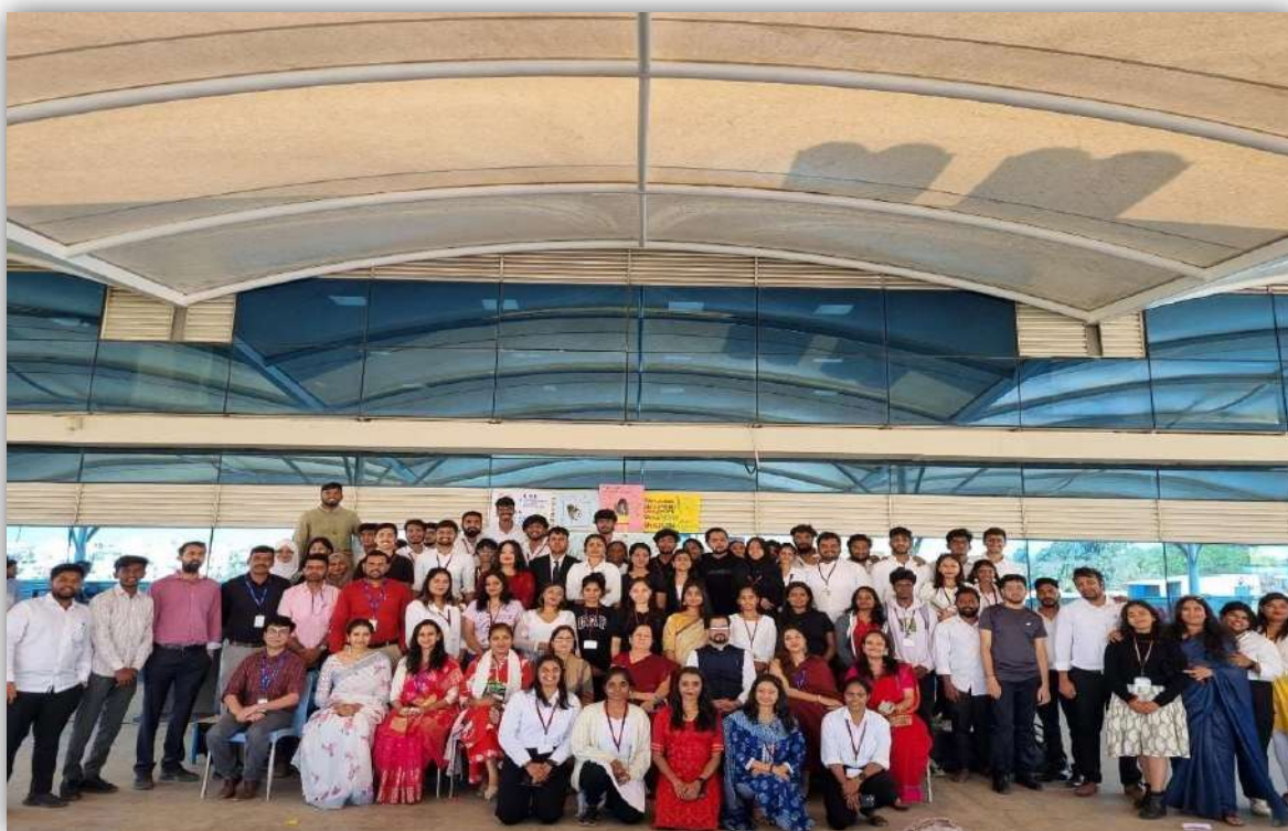
Women's Day 2025: Celebrating Strength and Equality