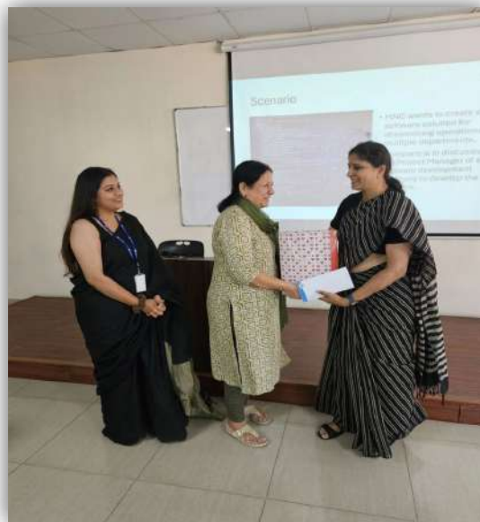
Masterclass on Contract Drafting & Negotiation Empowers Legal Minds