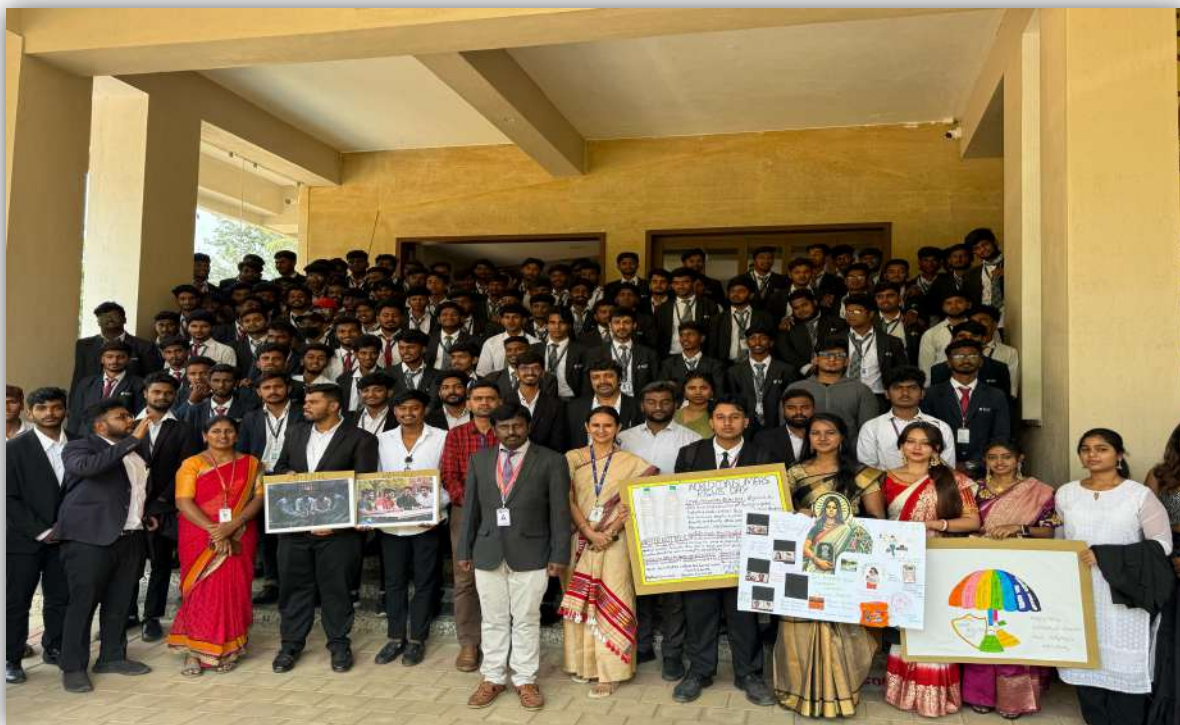
Legal Awareness Program by DSU at Spurthy Law College:

The session covered a range of critical topics, including the importance of legal awareness, Fundamental Rights and Duties, women empowerment, cyber bullying, consumer protection rights, anti-ragging laws, and substance abuse among youth. Through this outreach, the participants gained a deeper understanding of how legal knowledge can be used as a tool for social change and individual empowerment. The program was well-received and underscored the significance of legal education beyond the classroom.