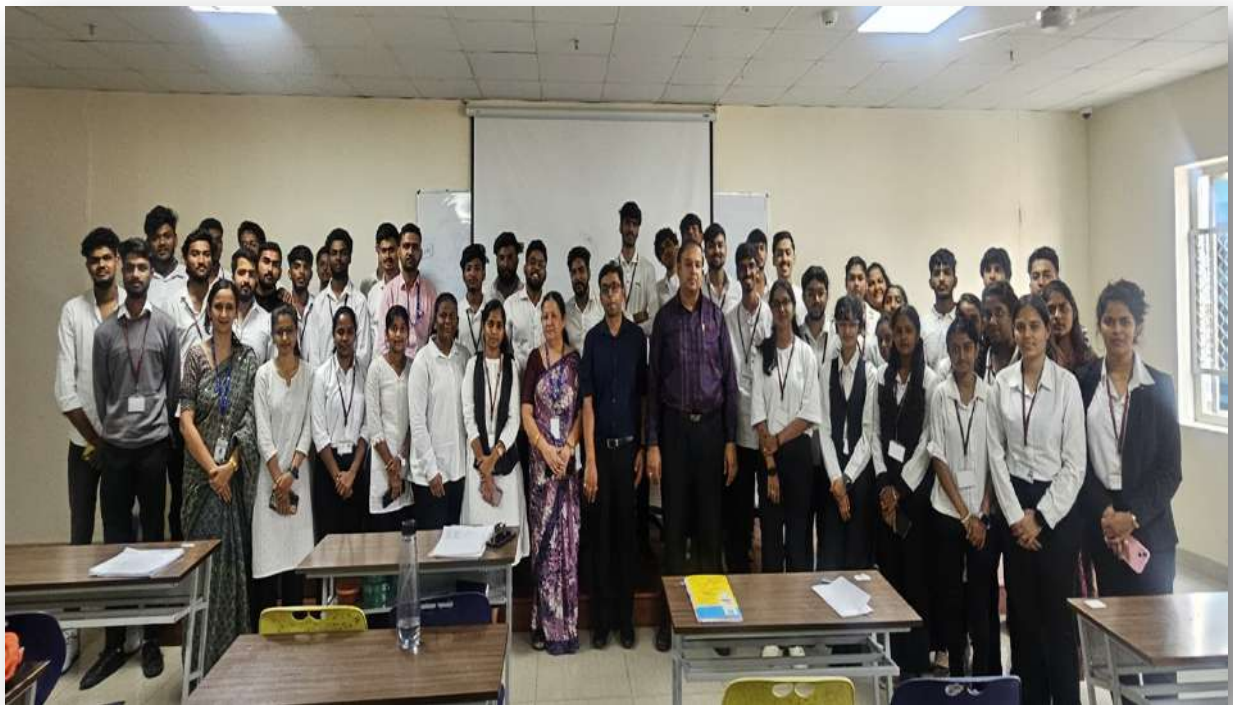
Session on Startups and Incubators by Legal Innovative Research Centre:

The speakers offered valuable insights into the dynamics of the entrepreneurial ecosystem, highlighting the pivotal role of incubators in nurturing innovation and supporting early-stage ventures. Through real-world experiences and strategic perspectives, they emphasized critical factors for startup success, including resilience, adaptability, and long-term planning. Attendees gained a comprehensive understanding of how incubators facilitate growth and sustainability in the startup journey. The session proved to be both informative and inspiring, encouraging students to explore entrepreneurial opportunities with a strategic mindset.