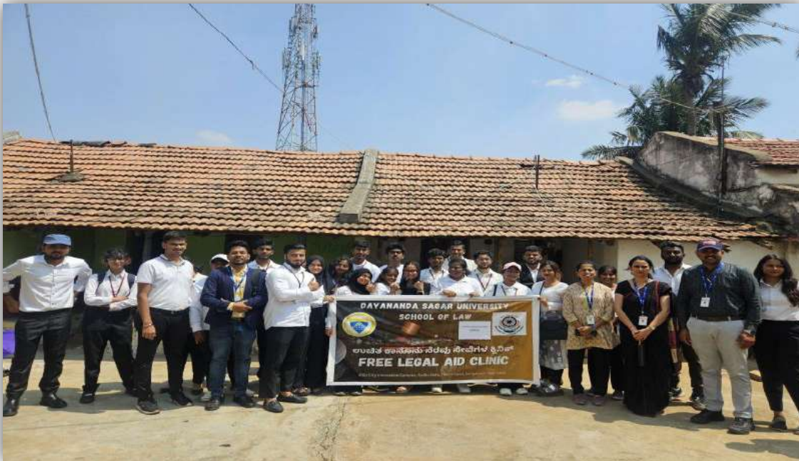
Bridging Law and Community | Legal Services Clinic, DSU at Gotegahalli Village