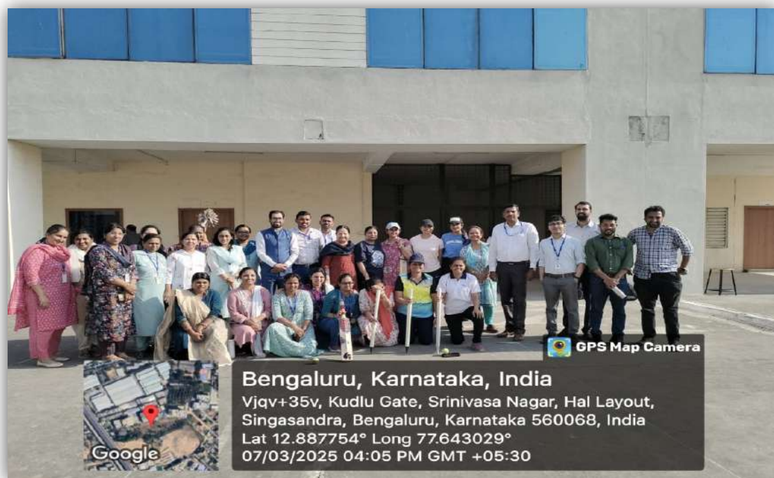
DSU School of Law Hosts Women's Cricket League on International Women's Day: