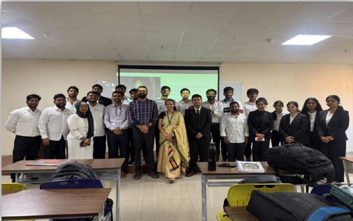
Legal Aid Workshop by School of Law, DSU